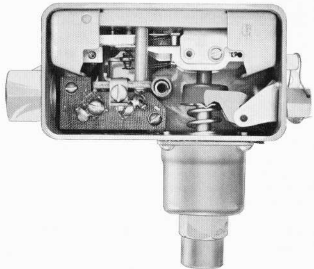
Fig. 1 - Low Oil Pressure Switch

The bellows stud (8) is screwed into the lever arm (4) so that the bellows portion just contacts the case and then is backed out about one turn. The range spring (7) counteracts the bellows and bellows spring upward pressure, and is adjusted to overcome their combined upward force at the low oil pressure setting of the switch. In the case of switch 8212824, this pressure is 17 psi. The